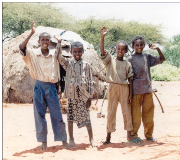
Children are the primary mission of Hillstrom's Sustainable Healthcare Enterprise Foundation.